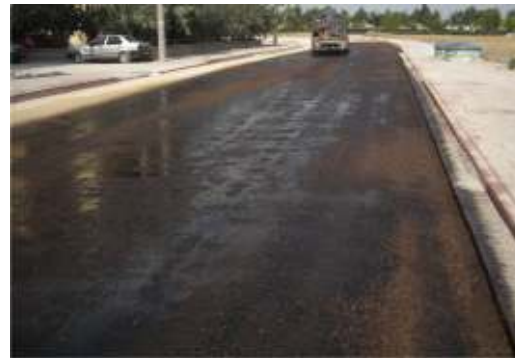
Terrapime with Cationic Bitumen Emulsion