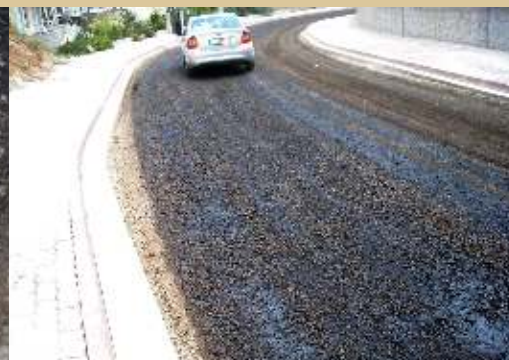
Quick set in 45-90 minutes